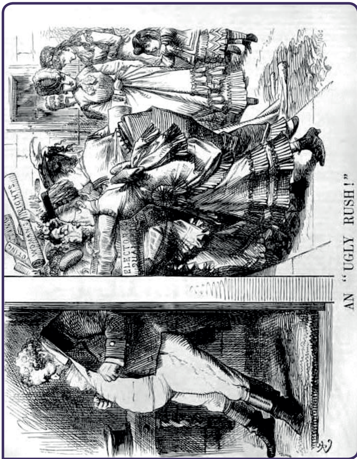
Lydia Becker and other suffragists beat at the door of John Bull demanding reform, whilst more demurely depicted women watch in the background. Punch magazine, 28 May 1870.