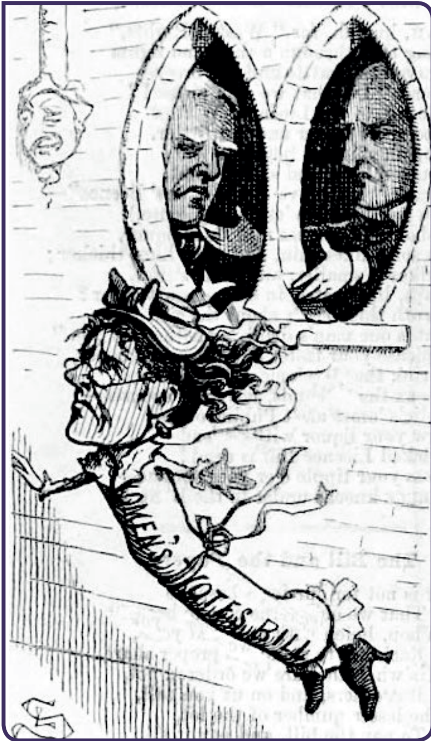
Lydia Becker being thrown from Parliament. Punch magazine, 20 May 1871.