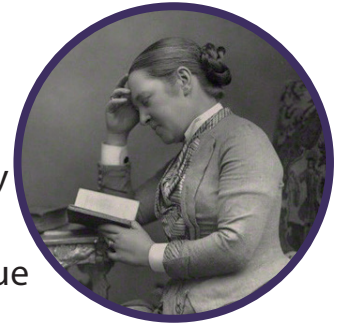
Image of Elizabeth Garrett Anderson

Elizabeth Garrett was born in Whitechapel, London. She was initially educated at home but at 13 was sent to boarding school. She was always interested in politics and current affairs but decided to pursue a career in medicine at a time when women were prevented from qualifying as doctors in Britain. She worked as a nurse while studying privately and was eventually allowed to attend the dissecting room and lectures at Middlesex Hospital until a petition by male students forced her to leave. She was refused entry to several medical schools but continued to study privately until taking her Society of Apothecaries exam in 1865, and was awarded a licence to practise medicine. She was the first British woman qualified to do so, but could not work at any hospital so set up her own practice, eventually providing medical care to poor women and children across London. In 1874, she co-founded the London School of Medicine for Women, the only teaching hospital to offer courses for women. A colleague of Darwin's wrote to Emma Darwin to ask her to support Garrett's becoming Professor of Physiology at Bedford College for Girls.