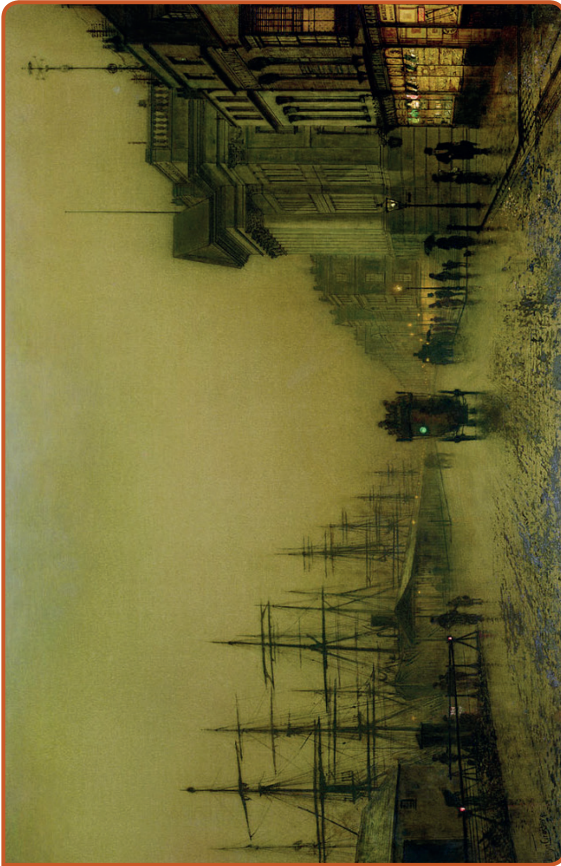
Liverpool Docks Customs House and Salthouse Docks, Liverpool (oil on canvas)

Grimshaw, John Atkinson (1836-93), NUL 166670 / Private Collection / The Bridgeman Art Library