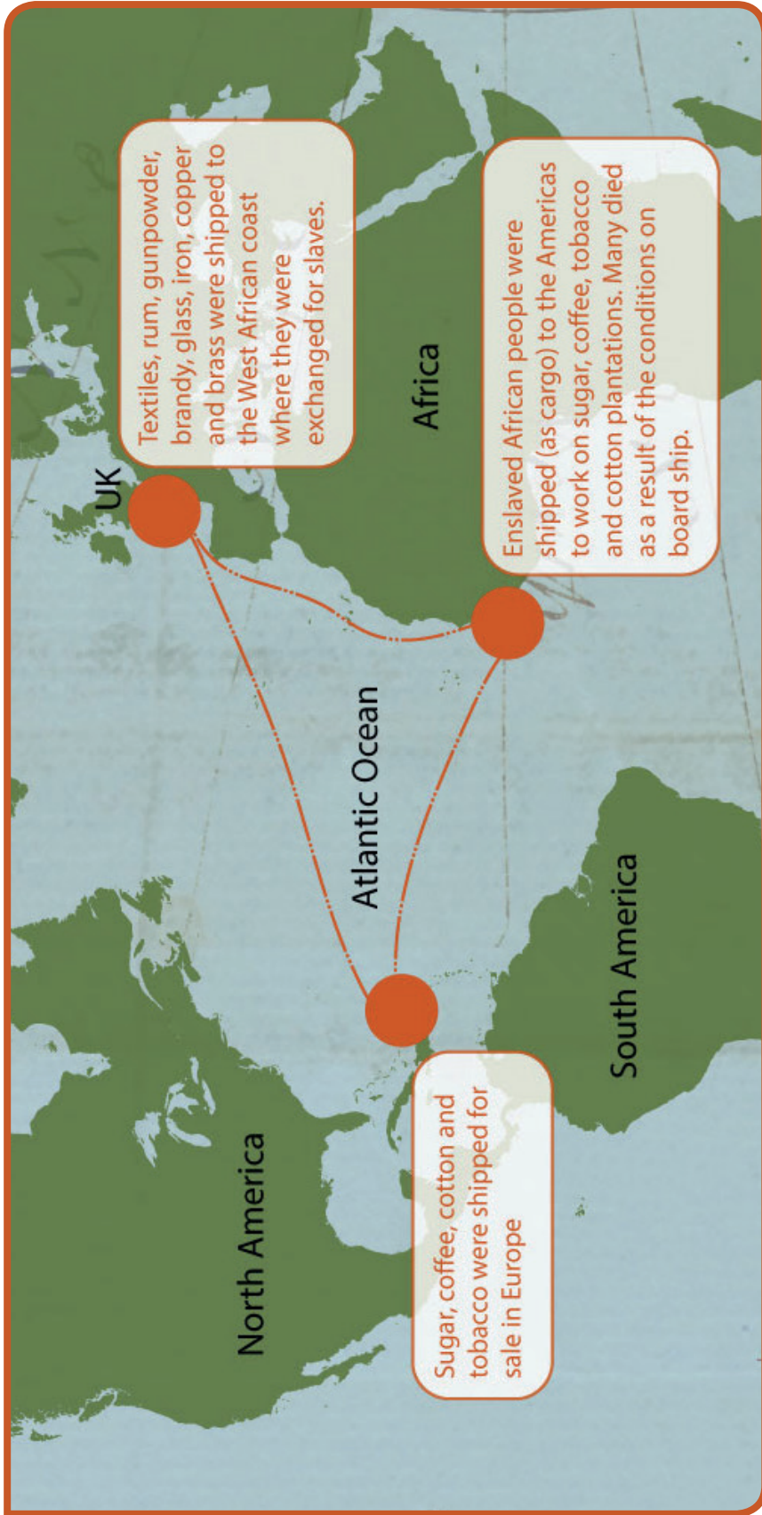
Transatlantic slave map